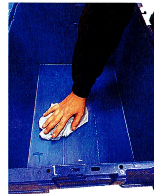
6 Dry Inside of Box – Using a clean paper wipe, wipe the inside of the box to ensure it's dry.