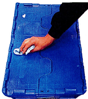
7 Clean Outside of Box – Spray cleaning solution outside the box, using a clean paper wipe, wipe the outside of the box.