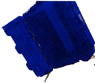
2 Empty Out Boxes – Empty out any contaminants from the boxes.