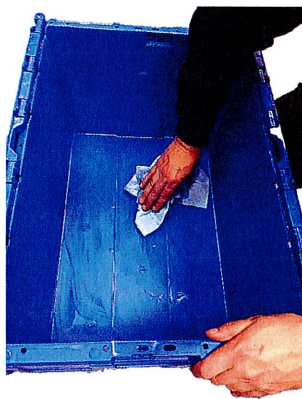
5 Clean Inside of Box – Using a clean paper wipe, wipe the inside of the box.