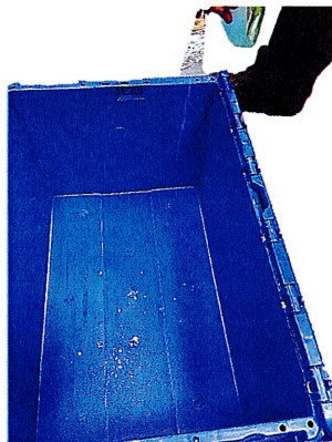
4 Spray Inside Box – Spray cleaning solution inside the box.